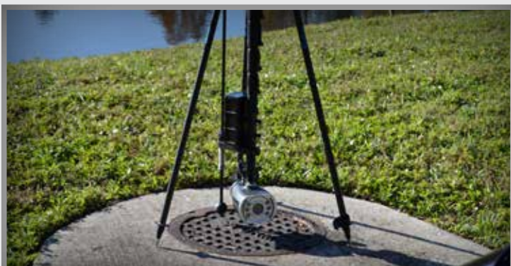
OPTIONAL TRIPOD AVAILABLE

QZ3 is mounted on a lightweight carbon fiber adjustable telescopic pole that can extend up to 24' (7 m)(optional 34' (10 m) pole is available). Get full HD views of cracks, breaks, pipe separations, scale, and various defect conditions from hundreds of feet away!