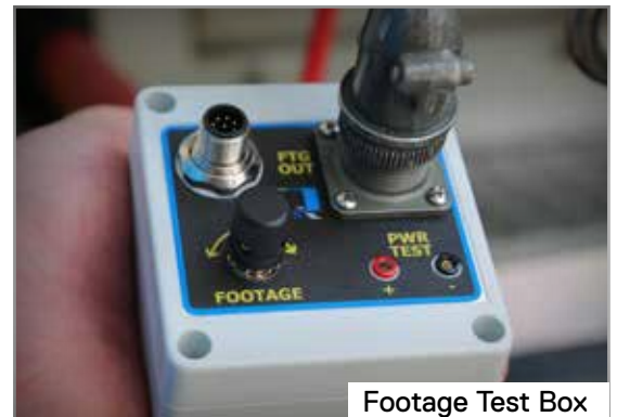
Footage Test Box