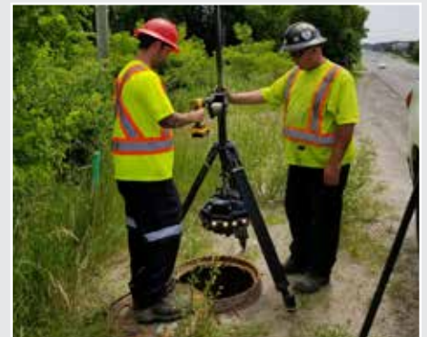
> Wireless Connection