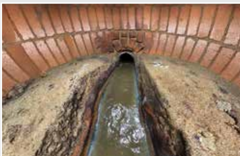
> Live Video

SPiDER provides a 190 degree field-of-view live video stream making it an ideal tool for I&I studies.