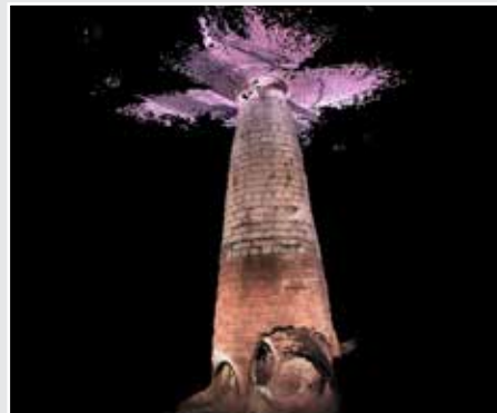
> Measurable Color Point Cloud