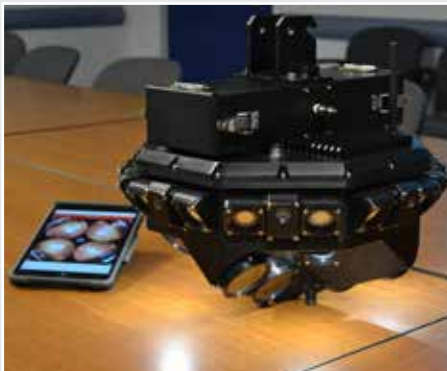
> Tablet Controlled