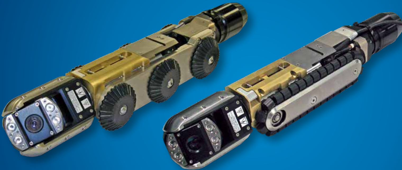
WTRIII transporter shown with the optional OZIII camera.