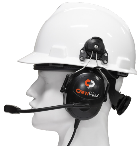
CHS-HHCLIP-DMG Hard Hat Clip-On Headset