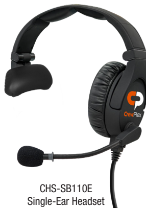
CHS-SB110E Single-Ear Headset